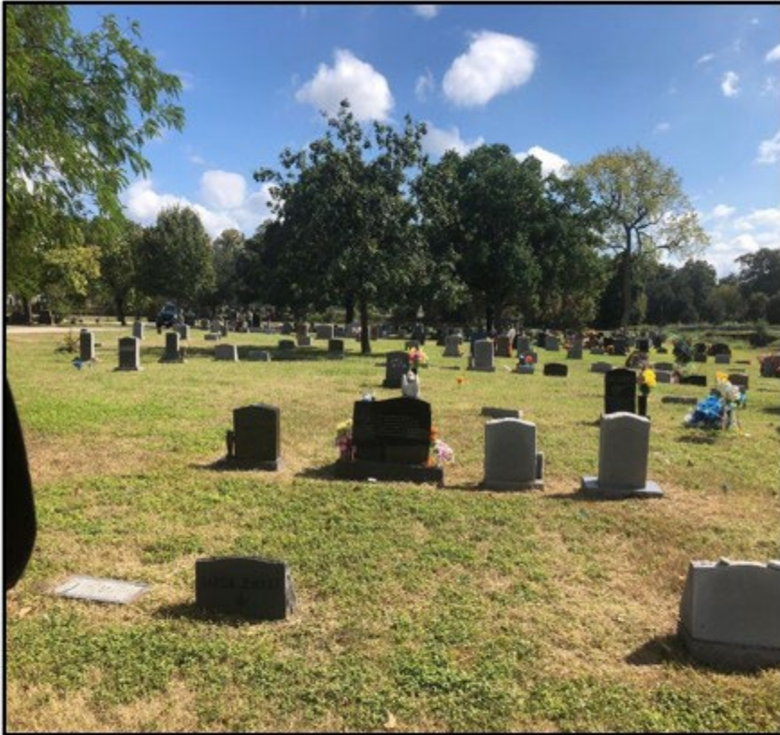
City of San Antonio Cemetery

City of Austin Cemeteries is seeking uniform and consistent rules and regulations similar to other City Municipalities.