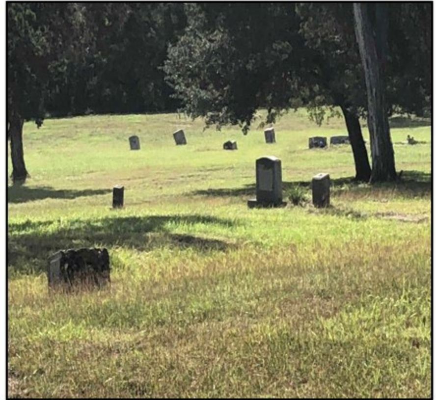
City of San Marcos Cemetery