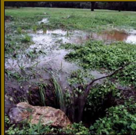
Water travels over land to enter the aquifer through this sinkhole