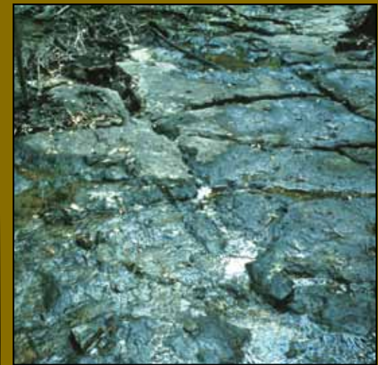
Water flows through cracks and fissures in this creek bed.