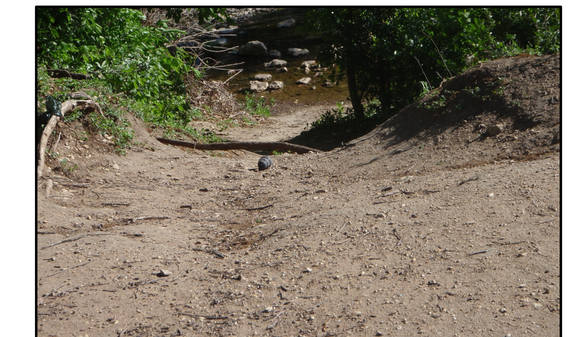
4 Repair and control erosion, restore soil, establish shade-loving plants, establish no mow zone