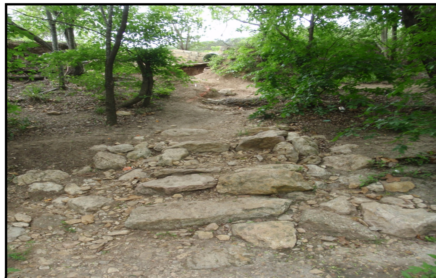
1 Repair eroded creek access point