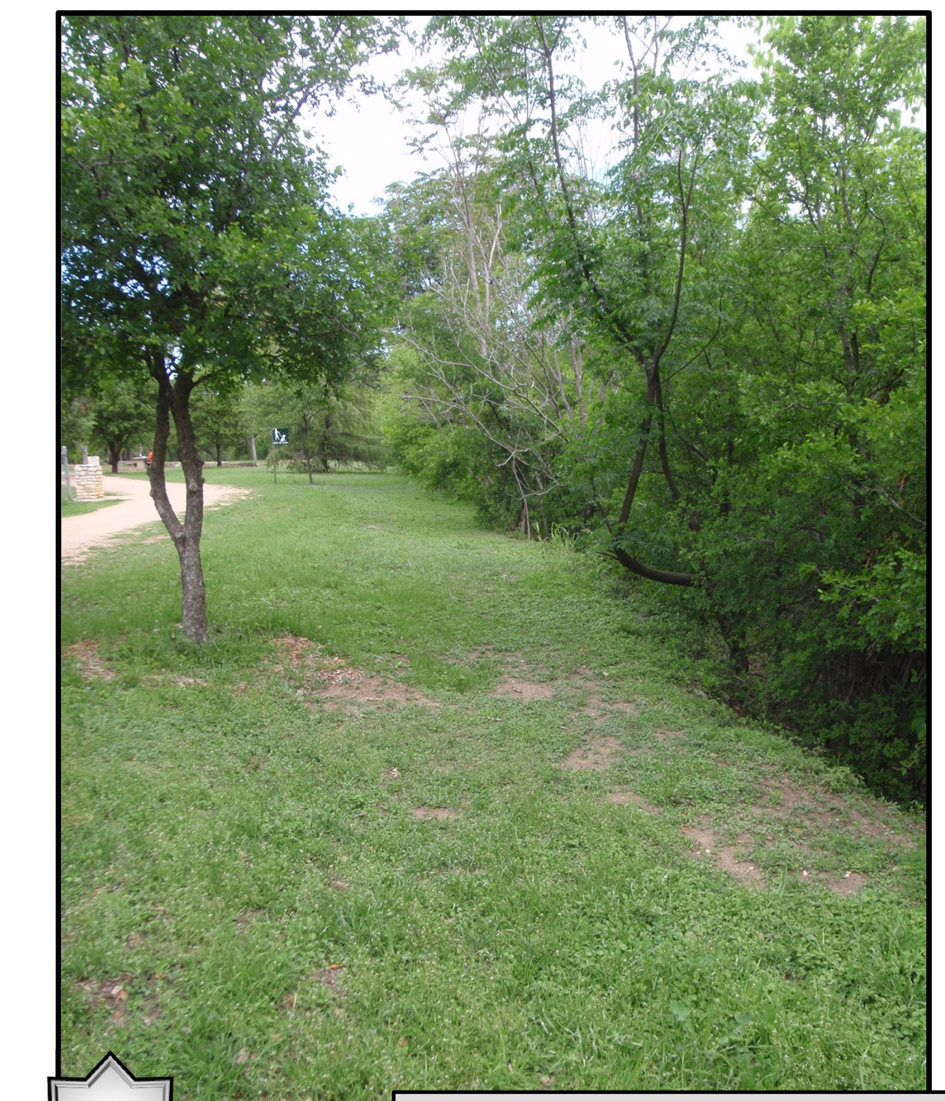
3 Restore soil, plant with seed, establish no mow zone