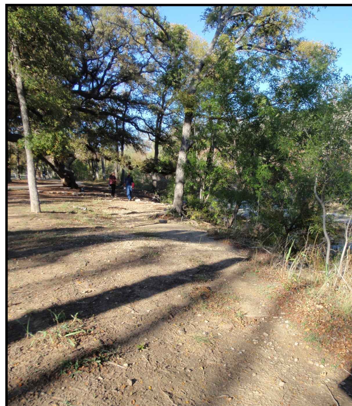
2 Restore soil, plant with seed, establish no mow zone