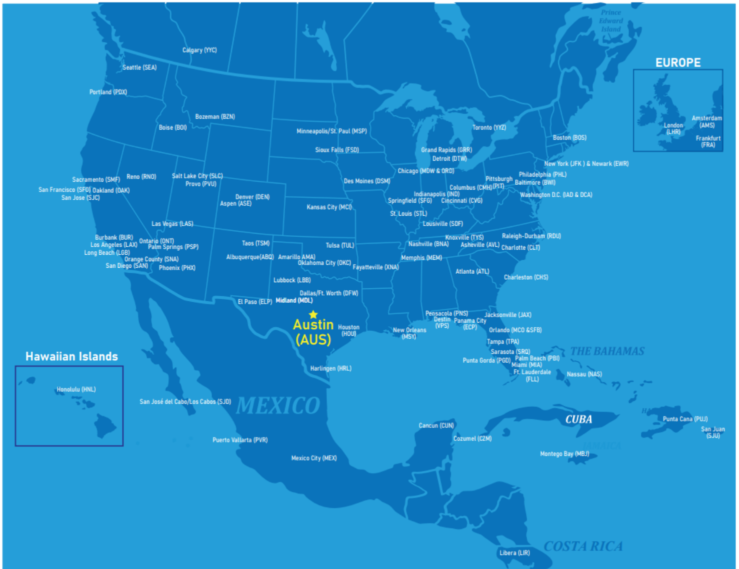
AUS Nonstop Map

The City of Austin Aviation Department owns and operates the airport and is powered by more than 400 employees. In 2021, 102,285 visitors used the services of the Visitor Information Centers and Podiums located in the Barbara Jordan Terminal.